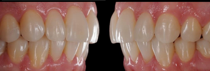
direct resin veneers