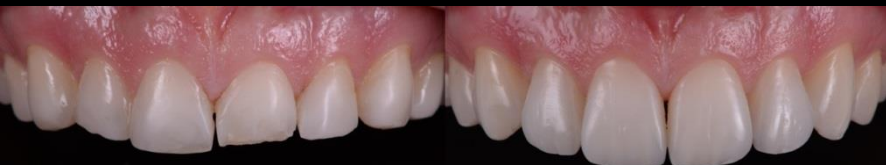
pre and post treatment